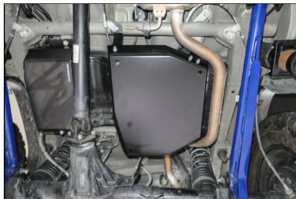
Illustration of installed state 安裝完成示意圖